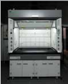
INVENTA SERIES FUME HOOD Labguard India Pvt Ltd