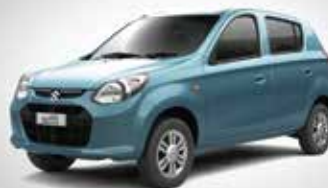
ALTO 800 Maruti Suzuki India Limited