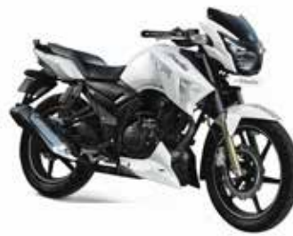
TVS APACHE RTR TVS Motor Company Limited