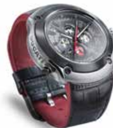
TITAN DUCATI X1 Titan Industries Limited