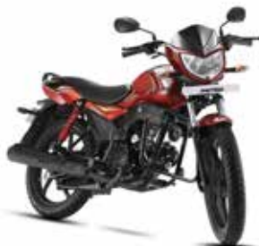
MAHINDRA PANTERO Mahindra Two Wheelers Ltd