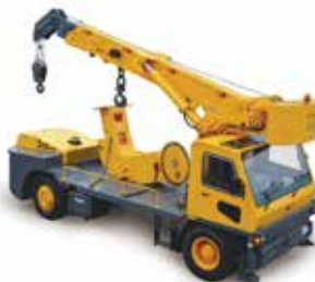
PIXEF 215 TIL Ltd