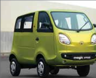
TATA MAGIC IRIS Tata Motors Limited