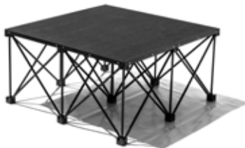
QUICKEE INDOOR STAGE Quickee Infra Pvt Ltd