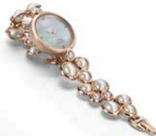
RAGA PEARL 'PEROLA' Titan Industries Limited