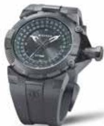
HTSE QUADRANT WRIST WATCH Titan Industries Limited