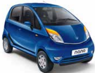
NANO MY13 Tata Motors Limited