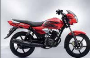
TVS PHOENIX TVS Motor Company Limited