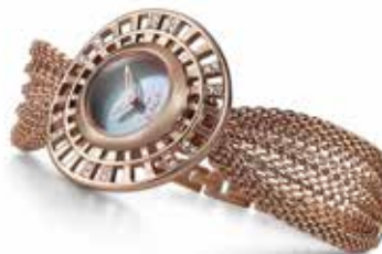
RAGA OPERA Titan Industries Limited