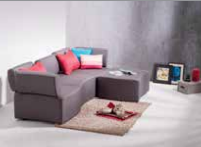
FREESTILE Godrej Interio, Godrej & Boyce Mfg Co Ltd