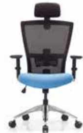
ELATE Wipro Enterprises Ltd