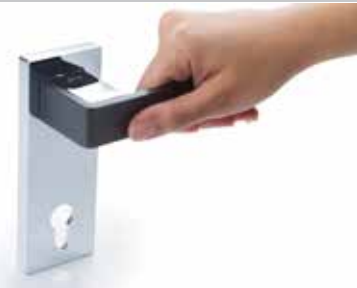
BLADE MORTISE HANDLE Godrej Locking Solutions & Systems