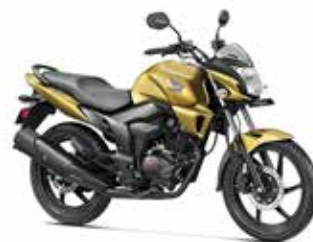
CB TRIGGER Honda Motorcycle & Scooter India Private Limited