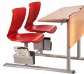
XPLORER Wipro Enterprises Ltd