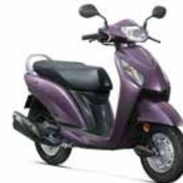
ACTIVA I Honda Motorcycle & Scooter India Private Limited