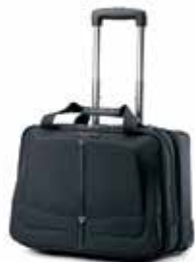
CARLTON MAGNUM LI LAPTOP STROLLER VIP Industries Limited