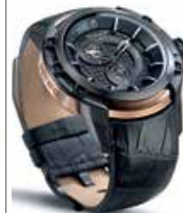
HTSE SOVEREIGN WRIST WATCH Titan Industries Limited