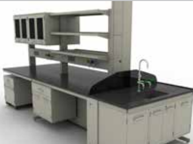
COVALENT Godrej Interio, Godrej & Boyce Mfg Co Ltd