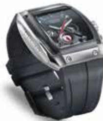
TITAN DUCATI X2 Titan Industries Limited