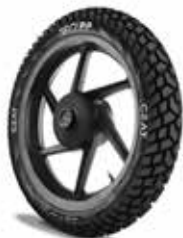
CEAT GRIPP CEAT