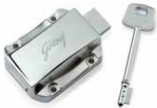
SUPERNOVA WARDROBE LOCK Godrej Locking Solutions & Systems