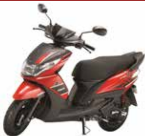
RAY Z India Yamaha Motor Pvt Ltd