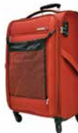
CARLTON O2 TROLLEY BAG VIP Industries Limited