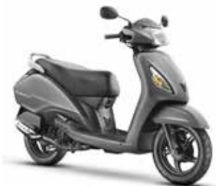
TVS JUPITER TVS Motor Company Limited