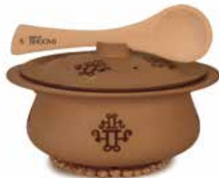
BHOOMI 2-WAY NON-STICK CLAY POT (2.5ltr) Nirlep Appliances Ltd