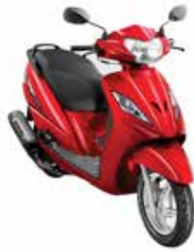
TVS WEGO TVS Motor Company Limited