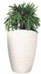
CHIARA Frontier Polymers Pvt Ltd